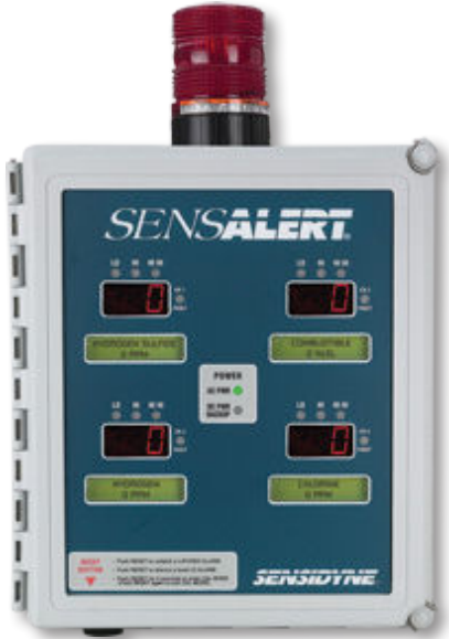
Four Channel with Strobe shown (PN# 7013227-4)