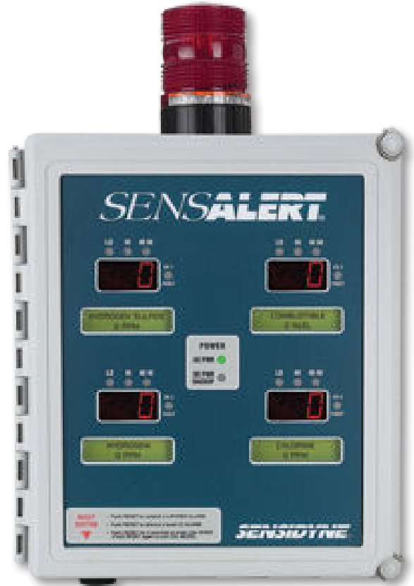
Four Channel with Strobe shown (PN# 7013227-4)