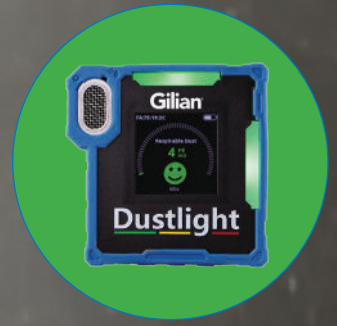
Safe Air Quality